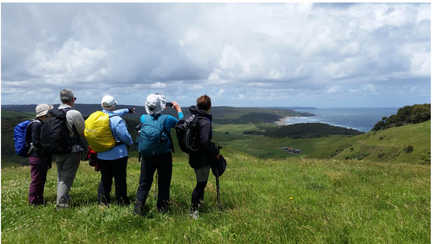
Image: Cape Otway Lightstation